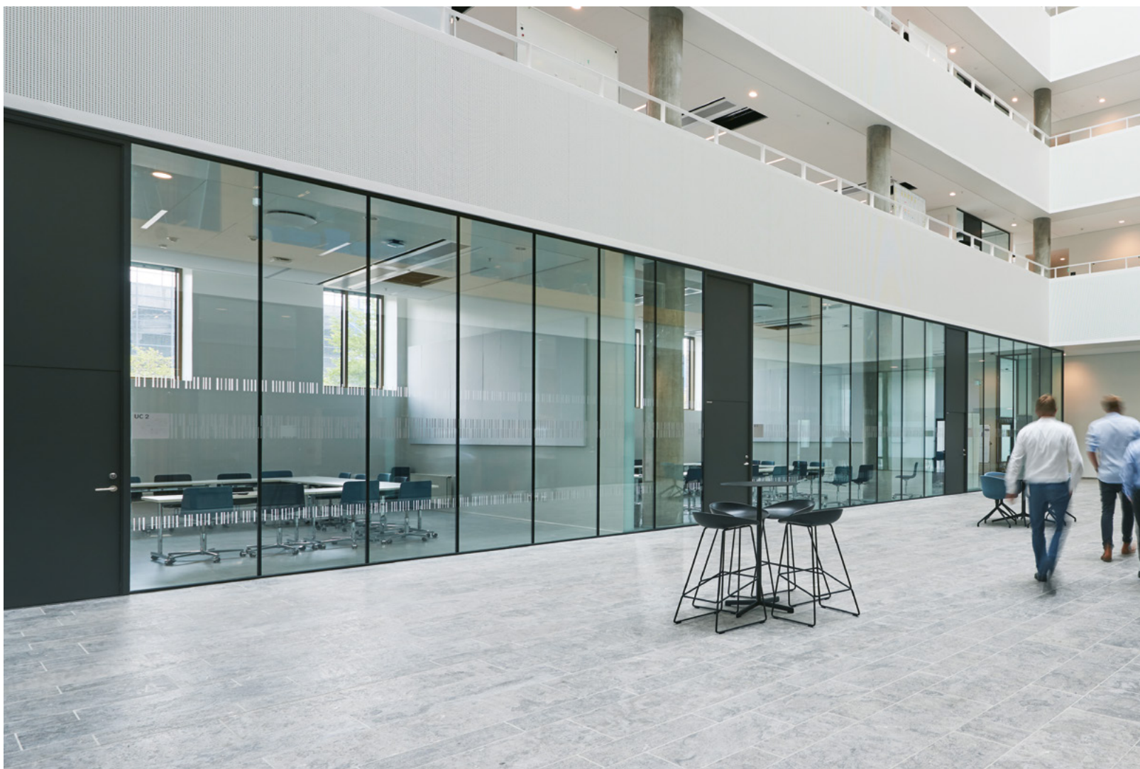
Meeting center. Nexus Cph, Kalvebod Brygge, Copenhagen

TRIPLAN LITE® | 46 - 50 dB | SOUND-RATED GLAZED WALL | WOODEN DOORS WITH A SOLID PANEL ABOVE