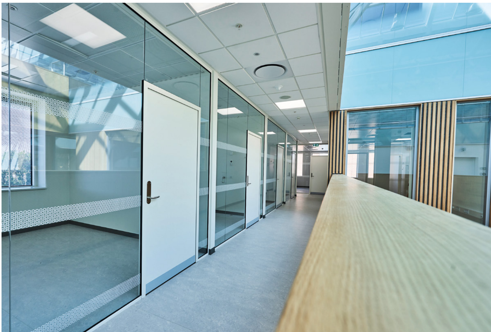
Treatment rooms. Danish Center of Particle Therapy, Aarhus

TRIPLAN LITE® | 34 - 43 dB | GLAZED WALL | WOODEN DOORS