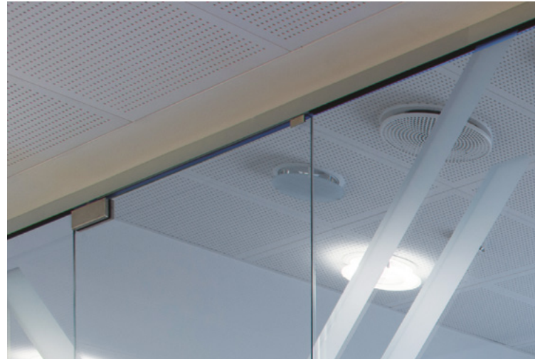
Pivot hinged door with top fittings and door stop. Symphogen, Ballerup