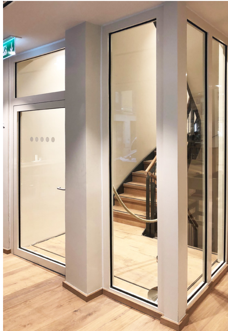
Indgangsparti. Roholmsvej, Albertslund