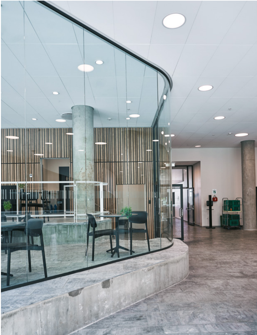
Canteen. Nexus Cph, Kalvebod Brygge, Copenhagen

CUSTOM MADE | CUSTOM MADE SOLUTIONS WITH CURVED GLASS