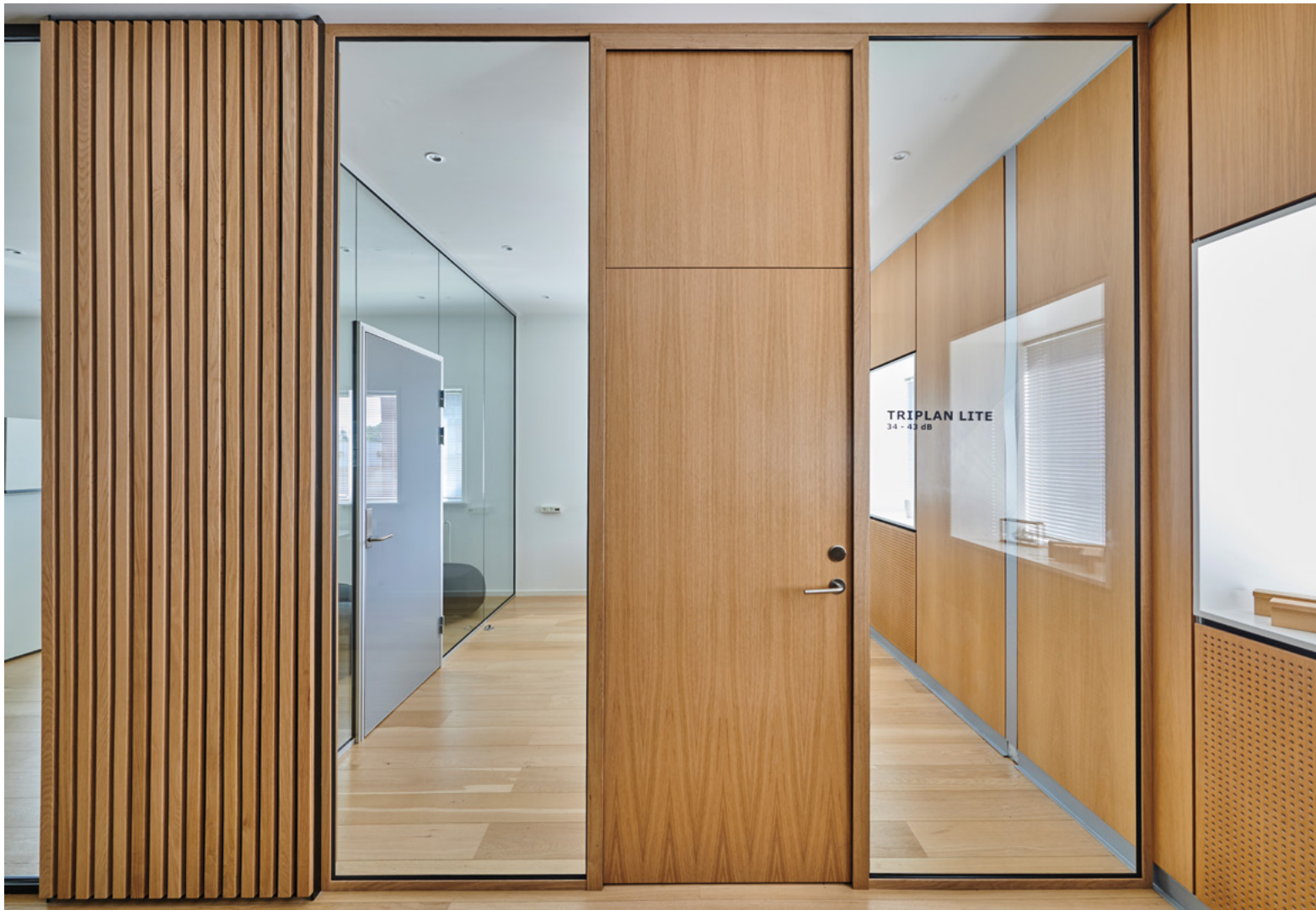
Triplan Showroom, Ishoej

TRIPLAN LITE® | WOOD | GLAZED WALL | WOODEN DOOR WITH A SOLID PANEL ABOVE