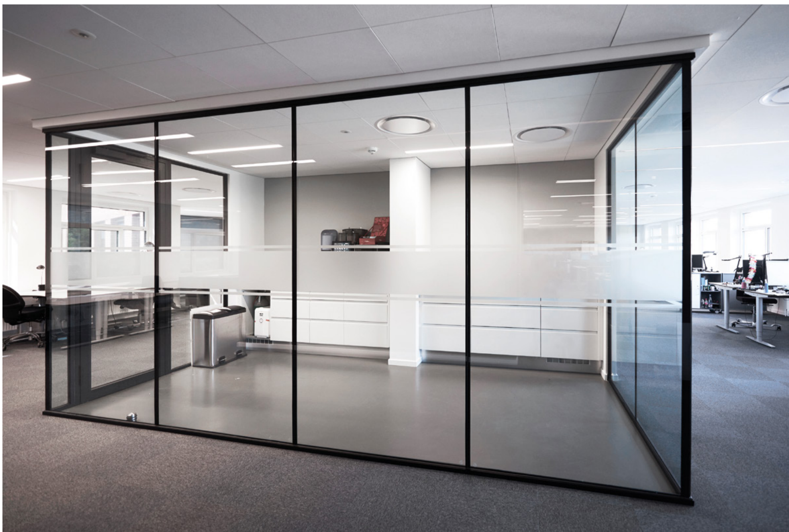
Kitchen. Movia, Valby

TRIPLAN LITE® | E - EI | FIRE-RATED GLAZED WALL | STEEL FRAME GLAZED DOOR