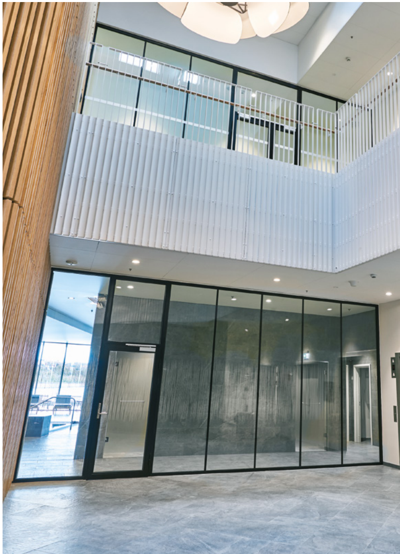
Lobby area. Fire-rated glazed wall. Hotel Alsik, Soenderborg

TRIPLAN LITE® | EI 60 | 46 - 50 dB | 34 - 43 dB | GLAZED WALLS