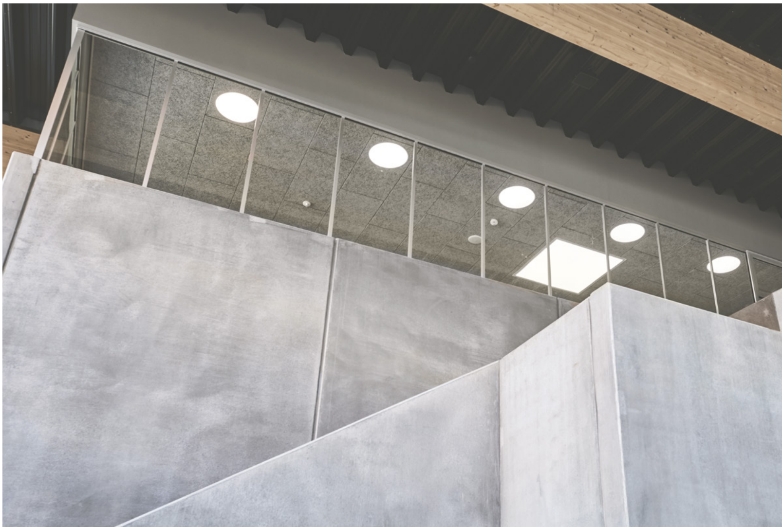
Administrations offices. The new Limfjord theatre, Mors

TRIPLAN LITE® | E - EI | FIRE-RATED GLAZED WALL | JUNCTION WITH TRANSOMS