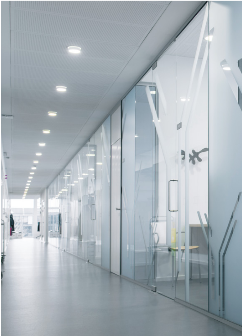
Administration rooms Symphogen, Ballerup

TRIPLAN LITE® | 34 - 43 dB | GLAZED WALLS | GLAZED DOORS WITH PIVOT HINGES