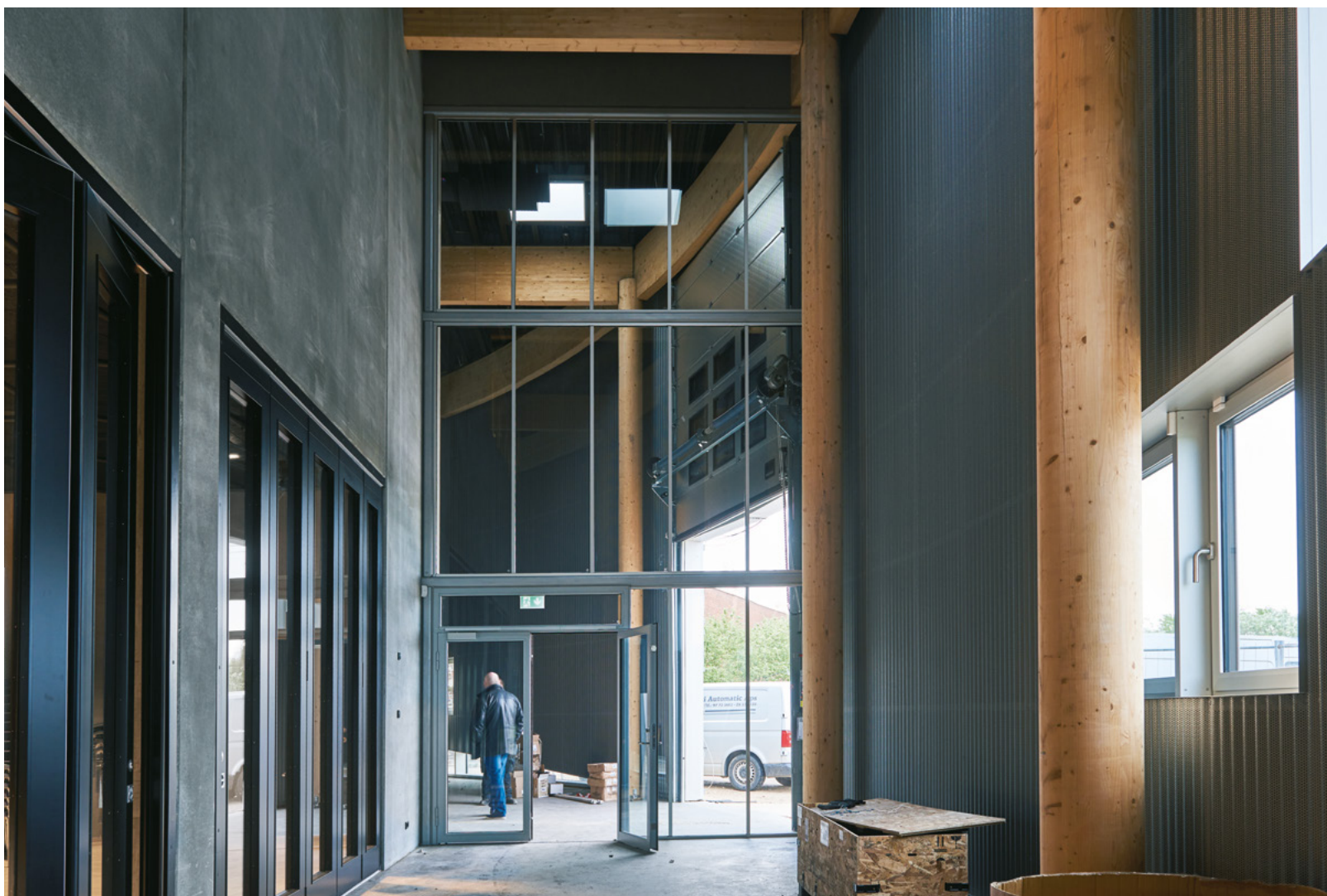
Workshop area. The new Limfjord theatre, Mors

TRIPLAN LITE® | E - EI | FIRE-RATED GLAZED WALL | STEEL FRAME GLAZED DOOR