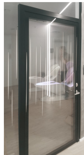
Double glazed glass door