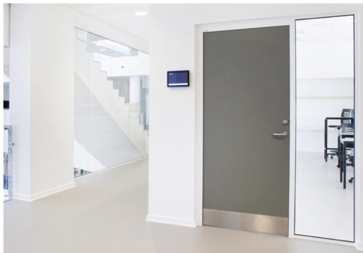
Teaching room. The Health building, Vejle