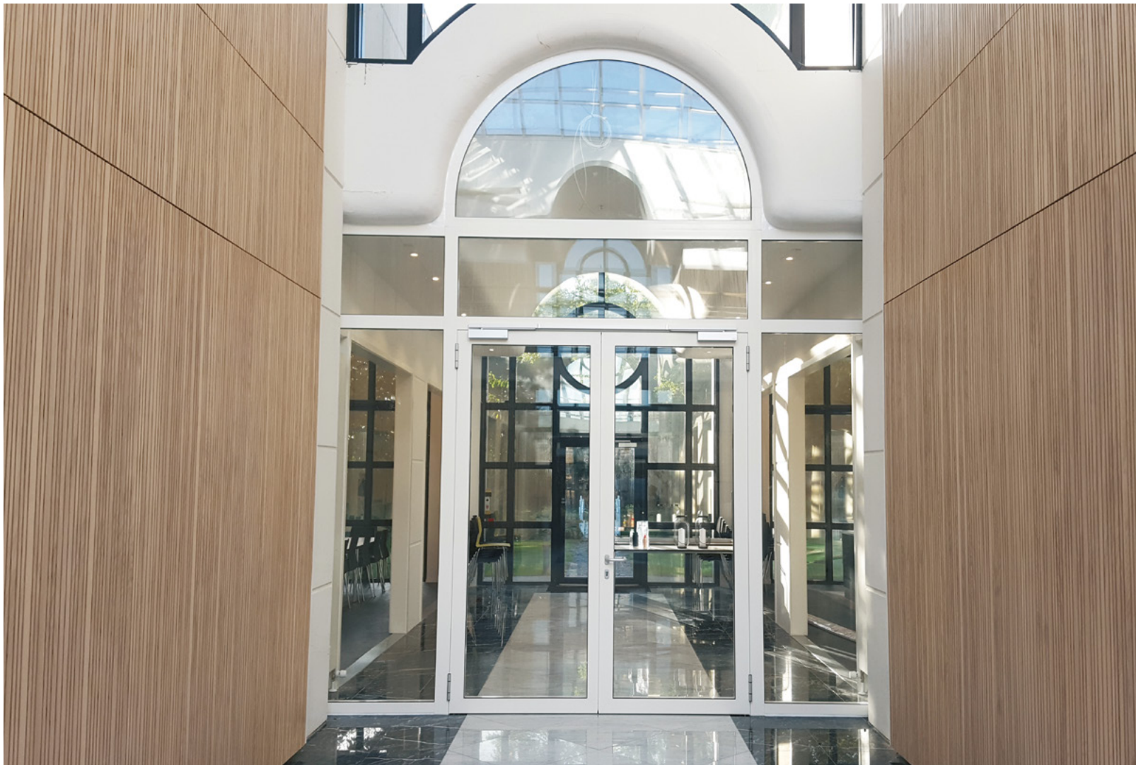
Indgangsparti. Roholmsvej, Albertslund

TP FIRE | ALU | UNCLASSIFIED | ALU-FRAME GLAZED DOOR