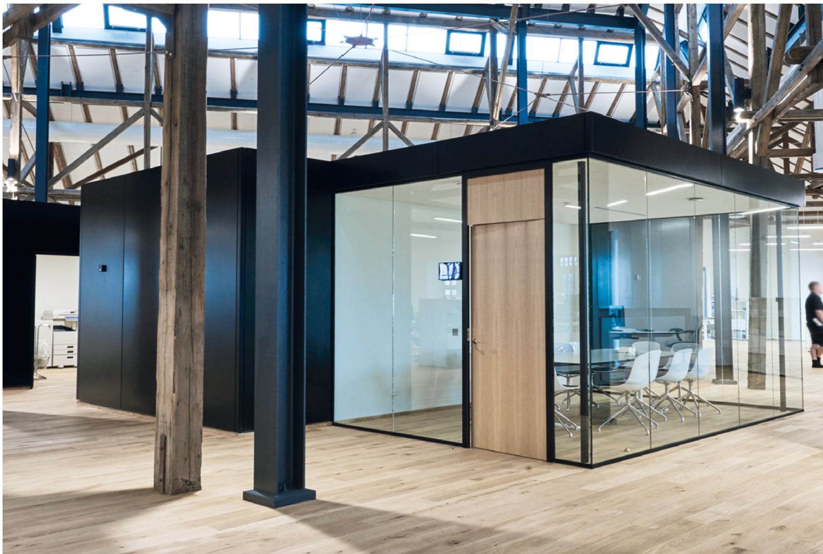
Meeting room. Domicile CASA A/S, Horsens

TRIPLAN LITE® | 34 - 43 dB | FULDGLASVÆG | GLAZED WALL | WOODEN DOOR WITH A SOLID PANEL ABOVE