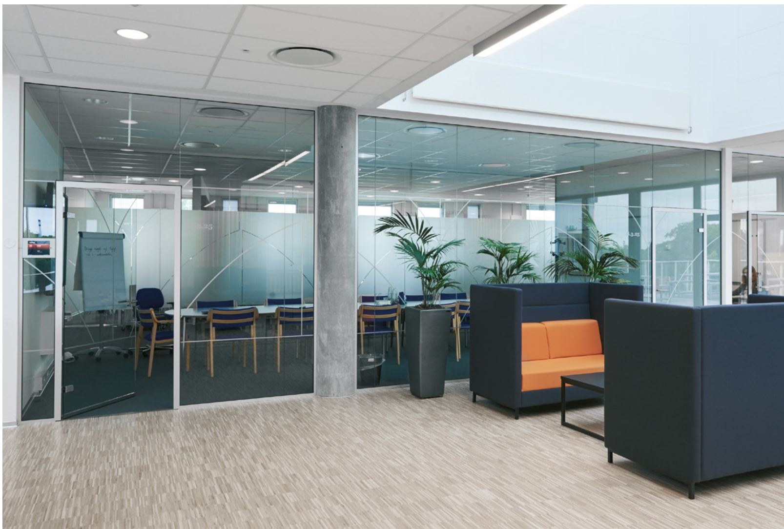
Meeting room. Billund City Hall

TRIPLAN LITE® | 34 - 43 dB | GLAZED WALL | GLAZED DOOR