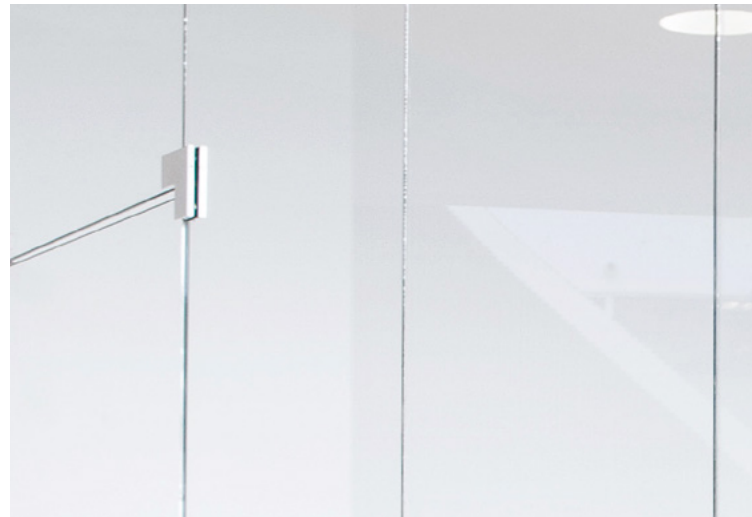
Pivot hinged door with corner fitting. Symphogen, Ballerup