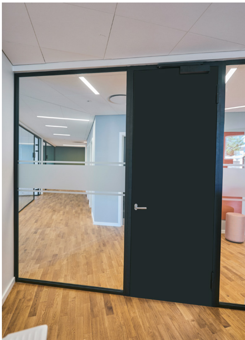
Class room. Movia, Valby

TRIPLAN LITE® | E - EI | FIRE-RATED GLAZED WALLS | WOODEN DOORS