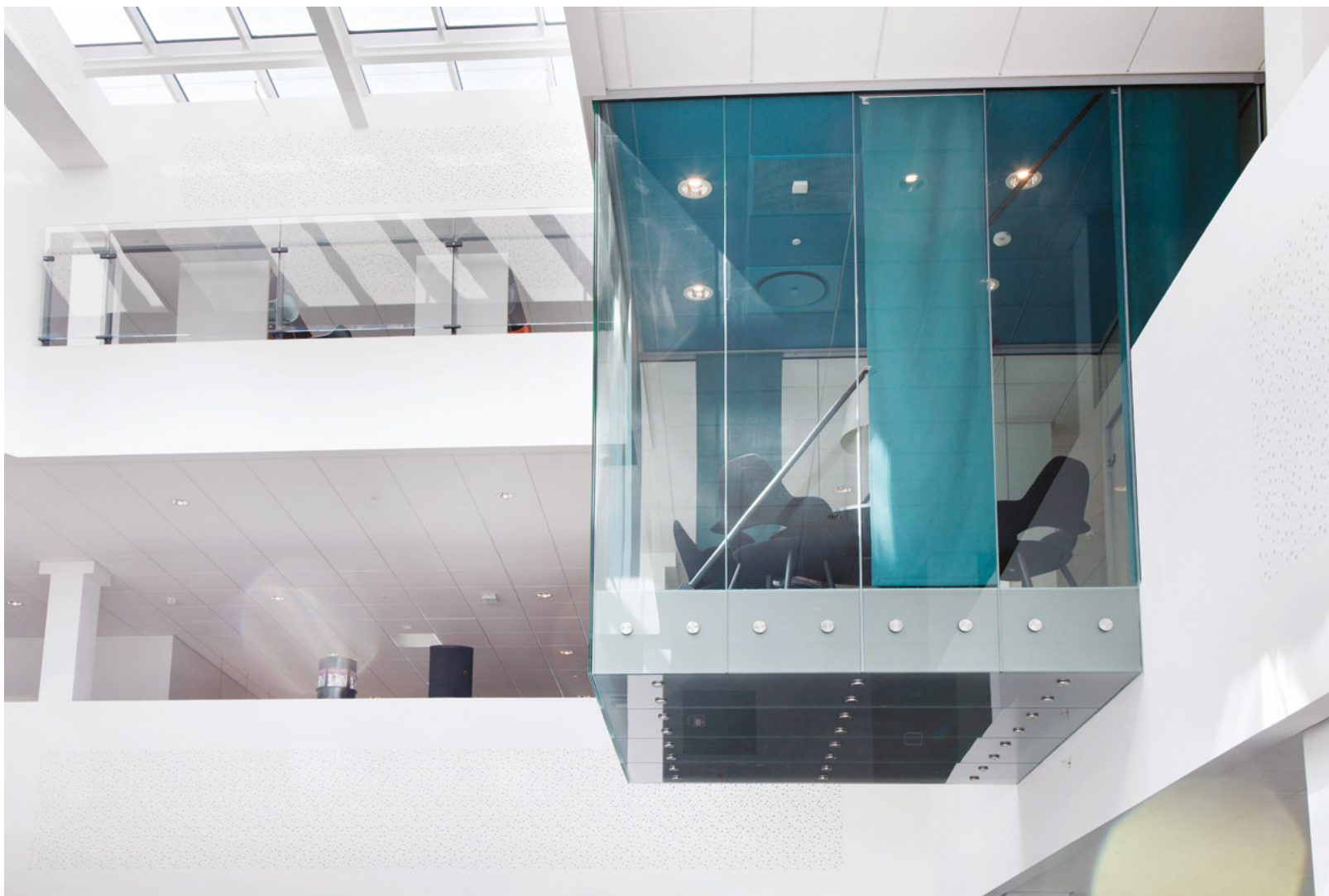
Meeting room. Business academy, Aarhus, Denmark

CUSTOM MADE | CUSTOM MADE SOLUTION WITH SUSPENDED GLAZED BOXES