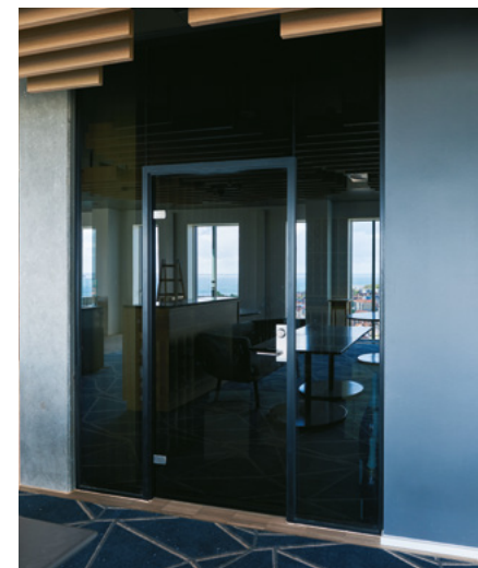
Black glazed door