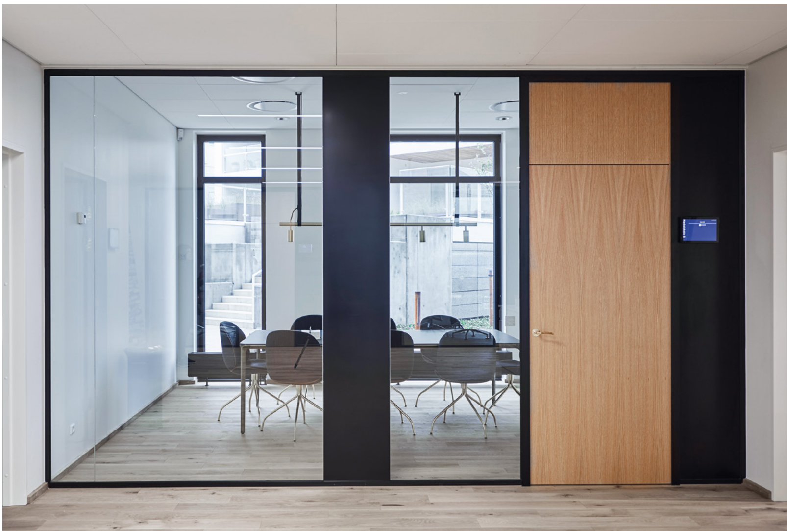
Meeting room. Domicile CASA A/S, Horsens, Denmark

CUSTOM MADE | CUSTOM MADE SOLUTION WITH INTEGRATED STEEL SHEETS | WOODEN DOOR WITH A SOLID PANEL ABOVE