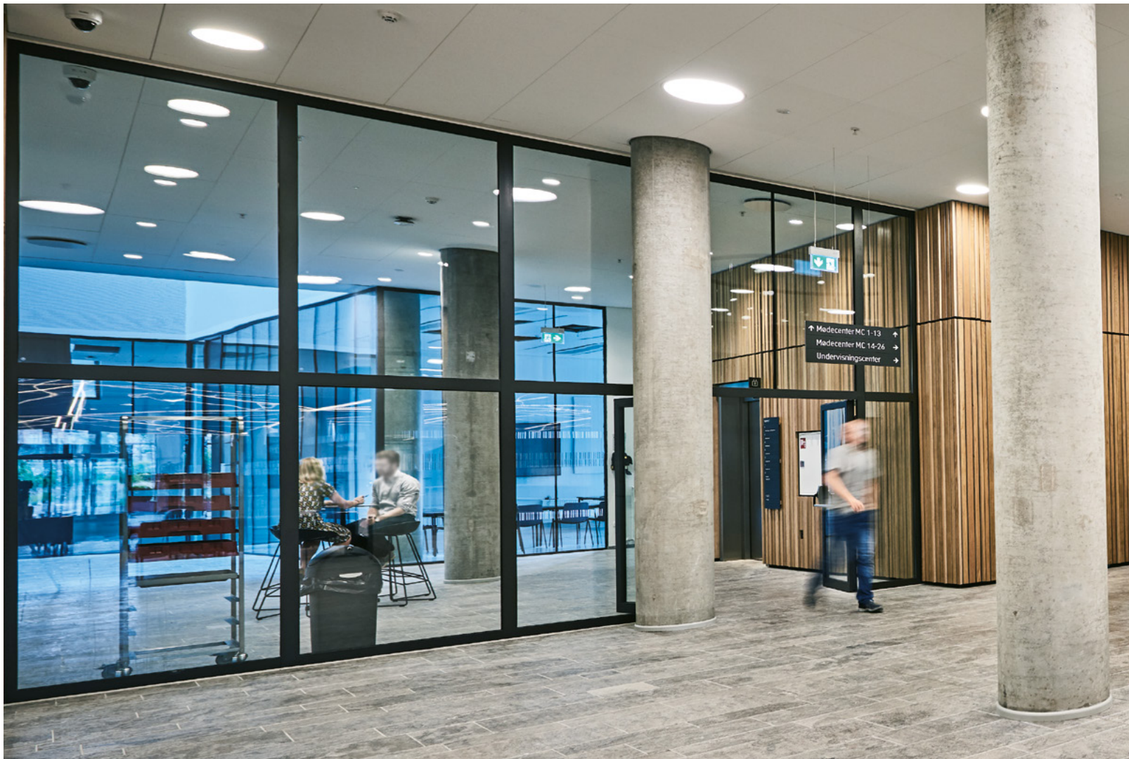
Meeting center. Nexus Cph, Kalvebod Brygge, Copenhagen

TP FIRE | STÅL | E - EI | STEEL FRAMED GLAZED DOOR WITH DOOR CLOSER