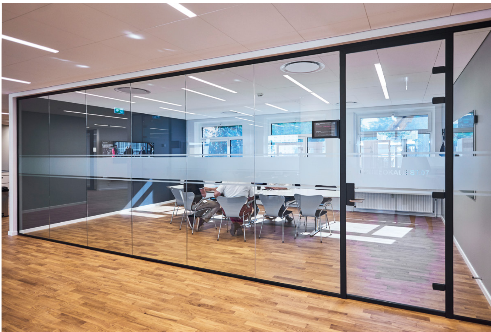
Meeting room. Movia, Valby

TRIPLAN LITE® | 34 - 43 dB | GLAZED WALL | FULL HEIGHT GLAZED DOOR