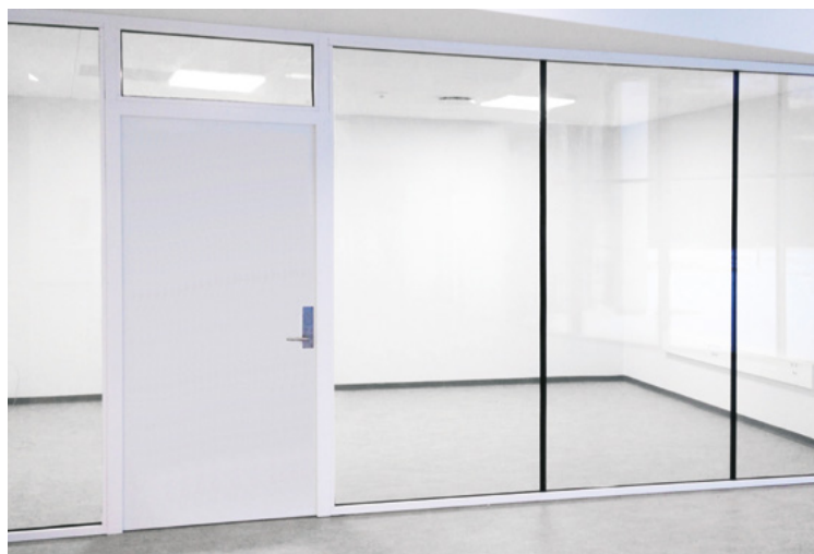
Odense University Hospital