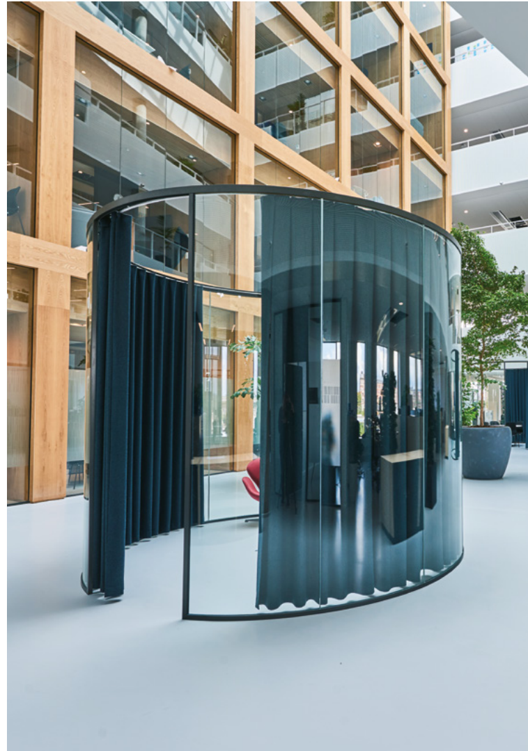
Break room. Nexus Cph, Kalvebod Brygge, Copenhagen