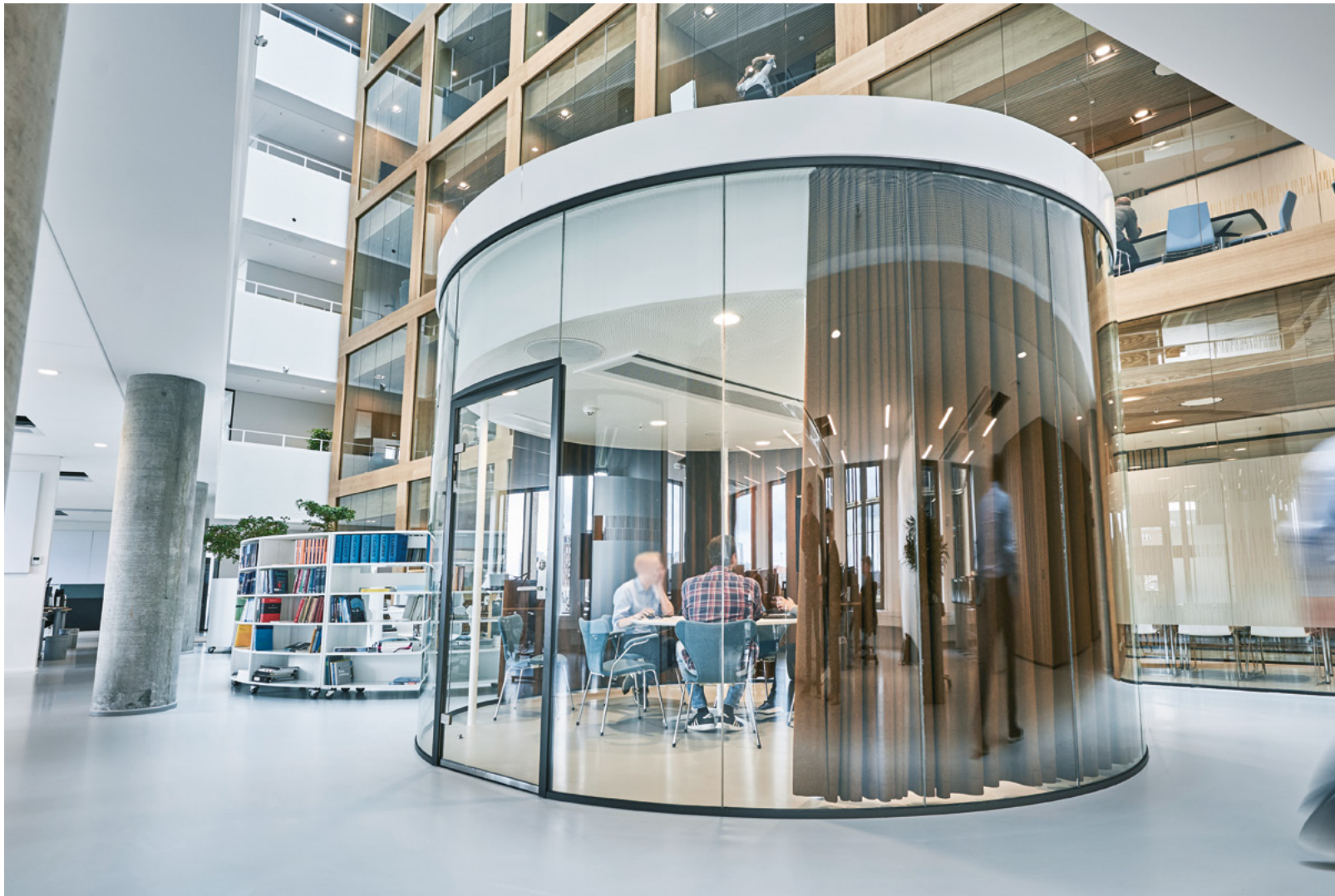
Meeting room. Nexus Cph, Kalvebod Brygge, Copenhagen

CUSTOM MADE | CUSTOM MADE SOLUTION WITH CURVED GLASS | GLAZED DOOR WITH CURVED GLAZED PANEL ABOVE