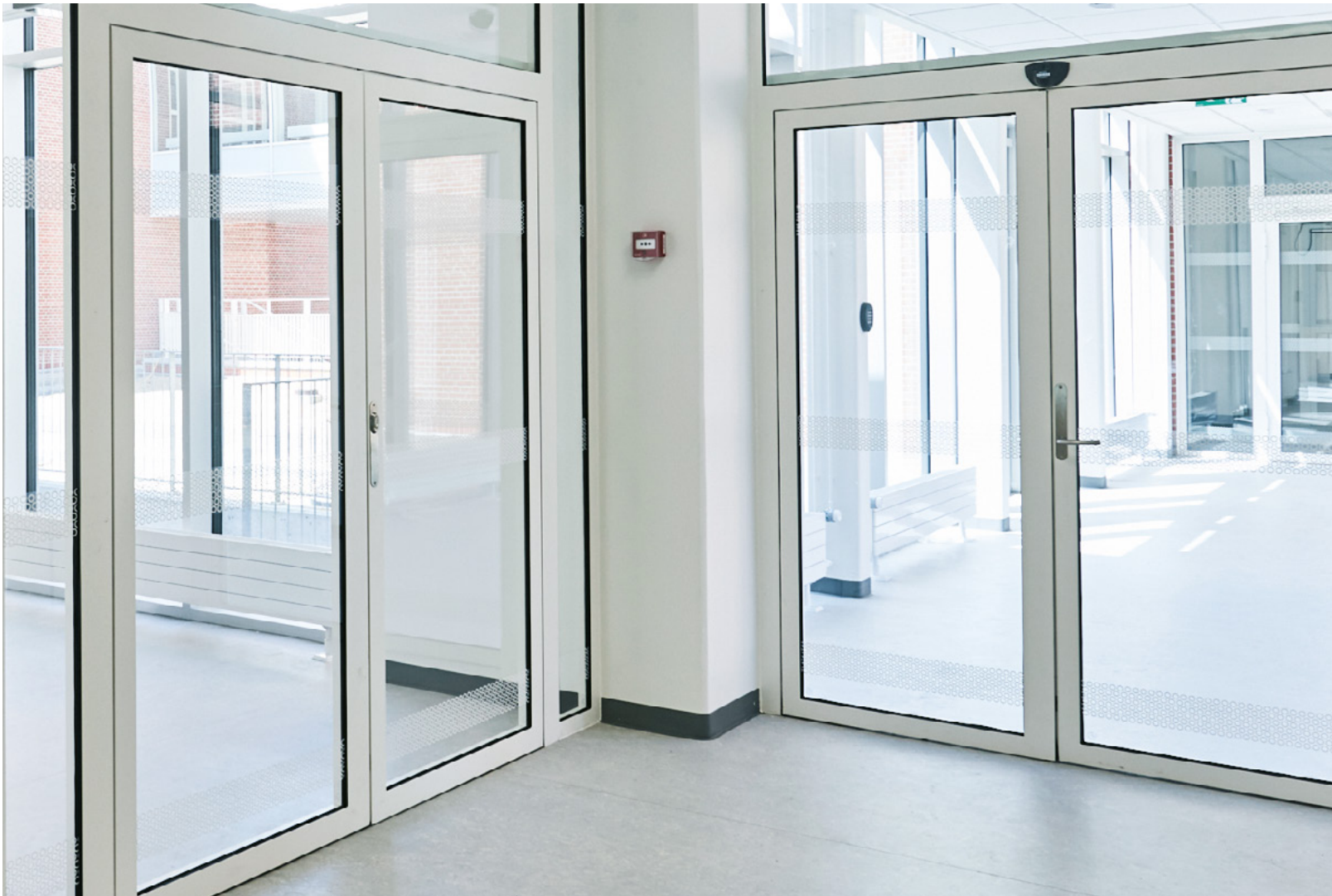
A pair of steel framed glazed doors. Danish Center of Particle Therapy, Aarhus

TP FIRE | STEEL | STEEL FRAME GLAZED DOORS